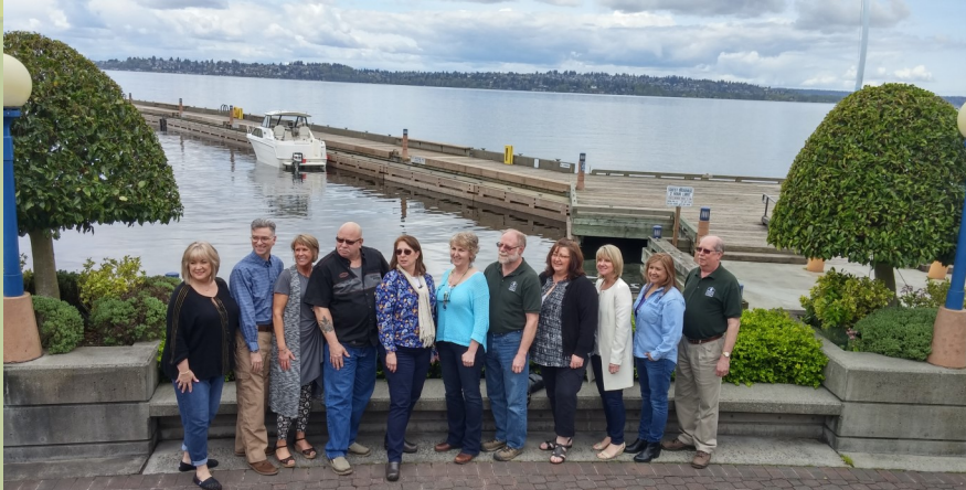
EXECUTIVE BOARD MEMBERS