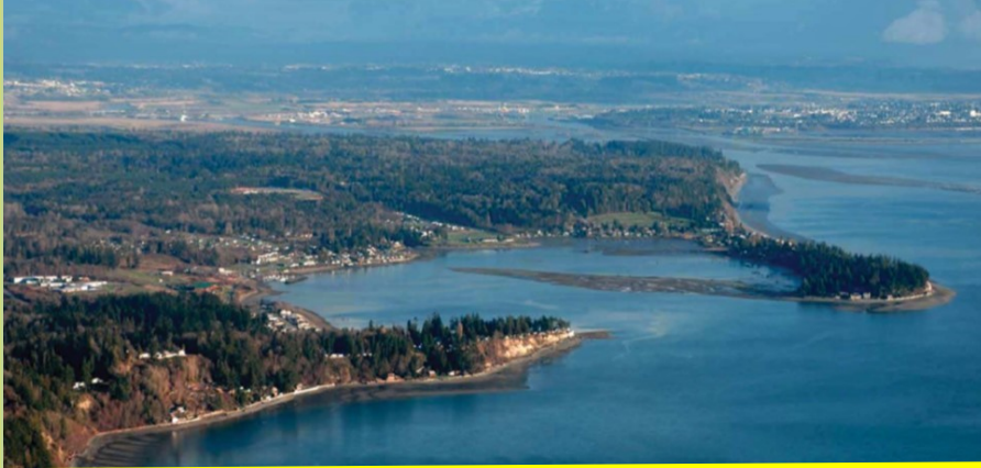
Tulalip Bay, the largest community within the reservation of the federally recognized Tulalip Tribes of Washington.

Code Enforcement Officer (Badge #007-that's right) with Tulalip Tribes.