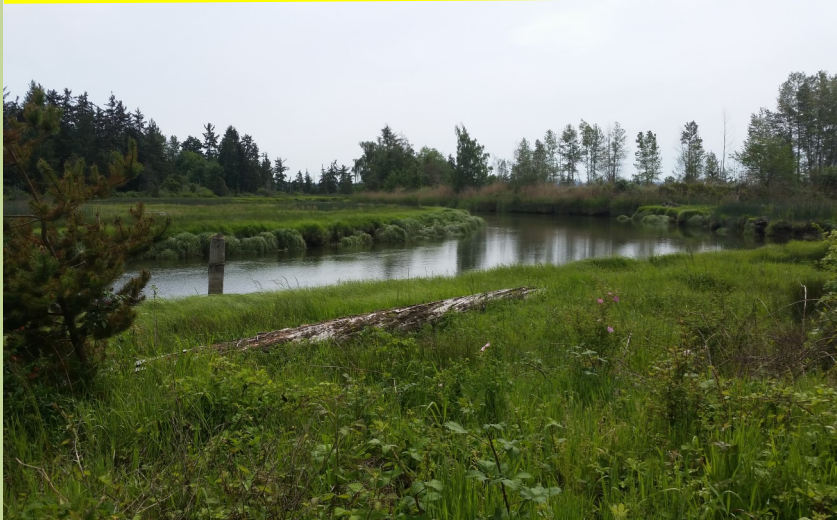
Tulalip Creek estuarine wetland area