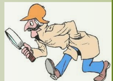
Greg Vause City of Bainbridge Island