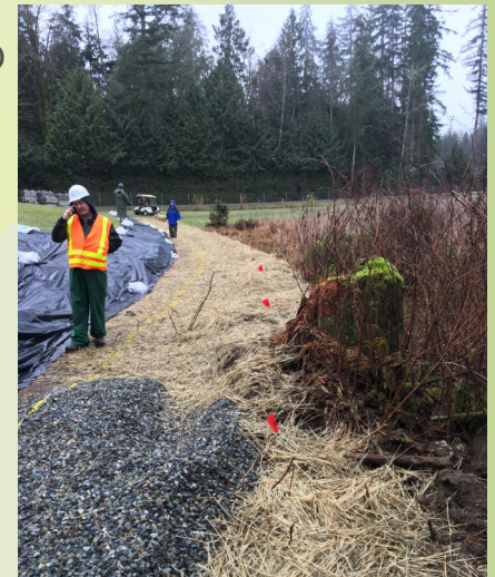
Average day in the field

I have a wide variety of daily duties that include working with the public and other agencies in outreach and education; investigation of small and large CE concerns. I'm encouraged to work to improve existing methods, and particularly satisfying I get to hopefully stop people from causing harm to our world and biota (plants & animals), and most importantly our children. I love my work and we have a great team of experts who collaborate in excellence.