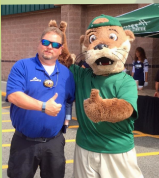
Federal Way Haggen Mascot sighting!

People would be surprised to know: My life prior to Code Enforcement was in the artwork and signage industry. Owning and operating a small manufacturing company provided me with the opportunity of working with government rules and regulations. I am very proud of the fact that during this time I created projects for The Empire State Building, Safeco Field, Century Link Field, Air Force One, Woodland Park Zoo West Entry and Penguin Exhibit to name a few.