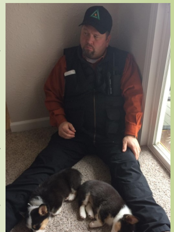
Code Enforcement at it's finest!

Best advice received: Some of the best advice I have been given is "Do what you say you're going to do, and finish what you started."